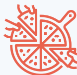
Sharing Food /Other Items