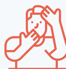
Touching Face /Nose/Eyes